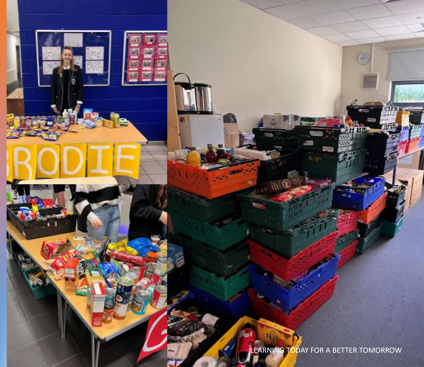
Foodbank Collection October 2023