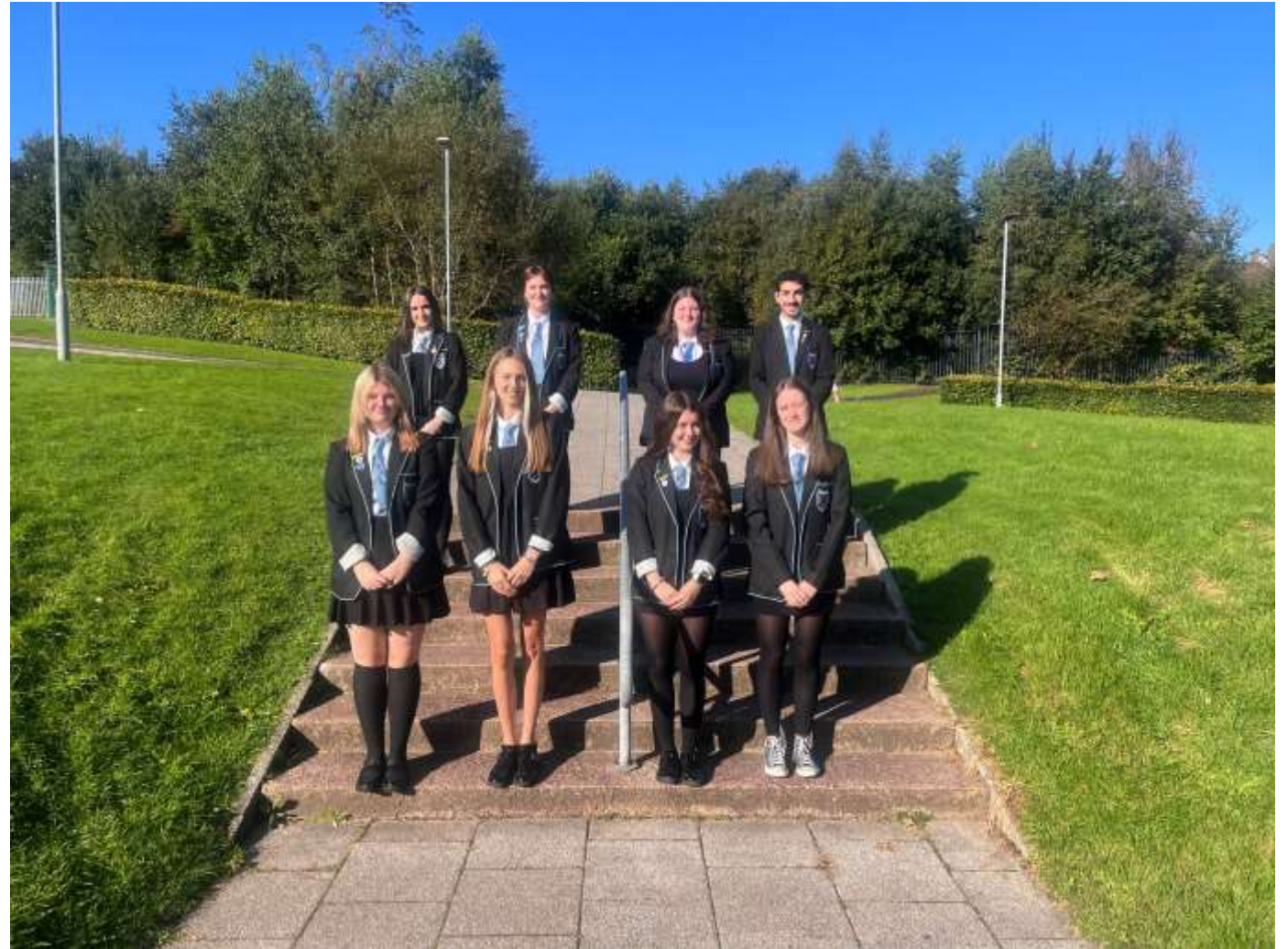
House Captains Session 2023- 24

House Captains promote the use of the Pupil Achievement Recognition Forms to ensure all pupils have the opportunity to have their achievements recognised and celebrated through the extra-curricular awards programme.