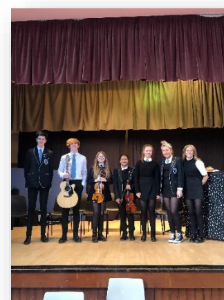
Performing at Stowbrae Kirk Lunch Club.