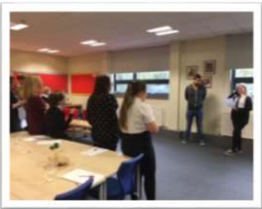
Parents in Partnership