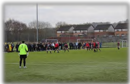
Staff vs Pupils Football