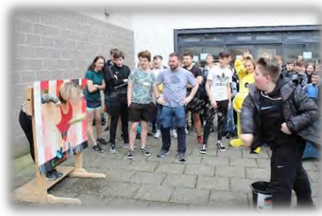
Sponge the Teacher

https://twitter.com/i/status/1063745438388576257